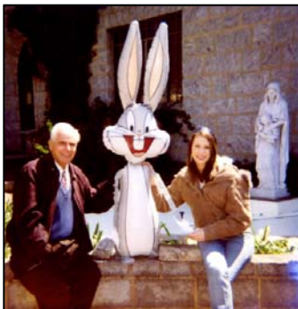
I recognize the guy in the middle...