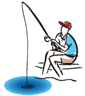
The 16th Annual Fishing Rodeo 2008 -

Date : September 13 th 2008 Time : 8.00a.m. to 12 Noon Location : Steele Creek Park Description : The event is free for the kids to enter with 3 age groups with both grand (bicycle) and multiple prizes, free t-shirts, free bait, free hot-dog lunch with drinks and each kid gets a goodie bag filled with vouchers. Each kid entered also takes home a free fishing rod.