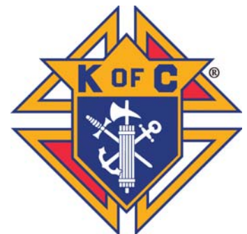
Knights of Columbus Council 6695

Did you know you can download archives of the Knights Newsletter at our web site? www.kofc6695.org