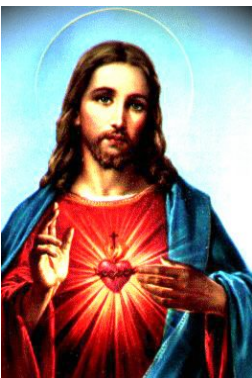
Sacred Heart of Jesus

“The greatness of a man is not always defined by what he has done—but what he has the potential to do!”