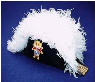
Only Fourth Degree Knights wear the full regalia and join the Assembly's Color Corps. The Color Corps is the most visible arm of the Knights. Official dress for the Color Corps is a black tuxedo, baldric, white gloves, cape and naval chapeau.

On October 15, 2006, Bishop Rafael Guizar Valencia (1878-1938) was canonized by Pope Benedict XVI in Rome, thereby becoming the first Knights of Columbus bishop declared a saint. Already in 2000, six other Knights were declared saints by Pope John Paul II.