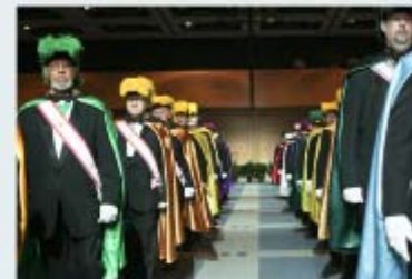
Quebec - The annual international convention of the Knights of Columbus